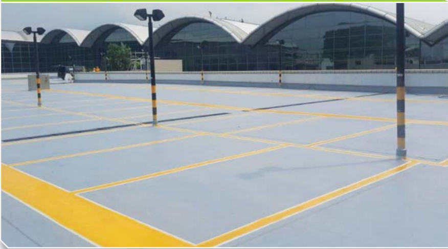
CP4 HK International Airport