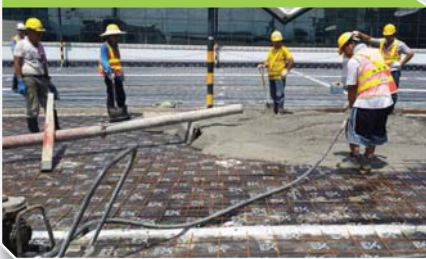
CP4 HK International Airport