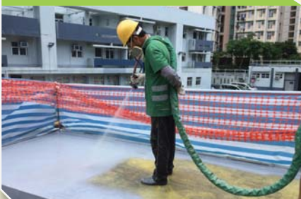
Kwun Tong Police Station