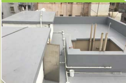
Roof of Residential Building