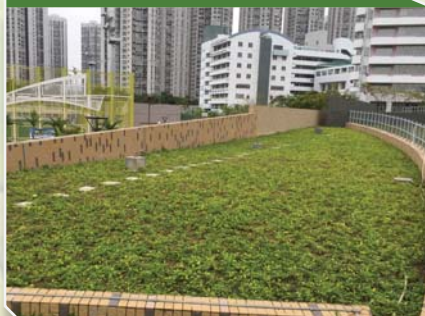
Tin Shui Wai