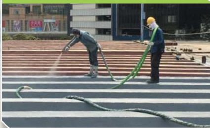
Sham Shui Po Sports Ground