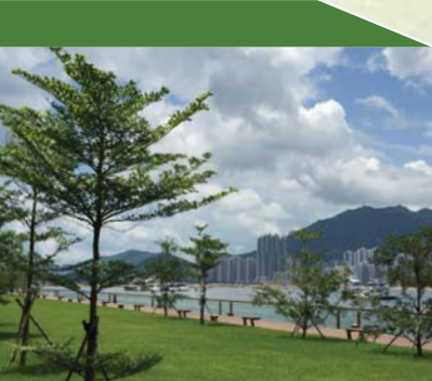
Kwun Tong Promenade